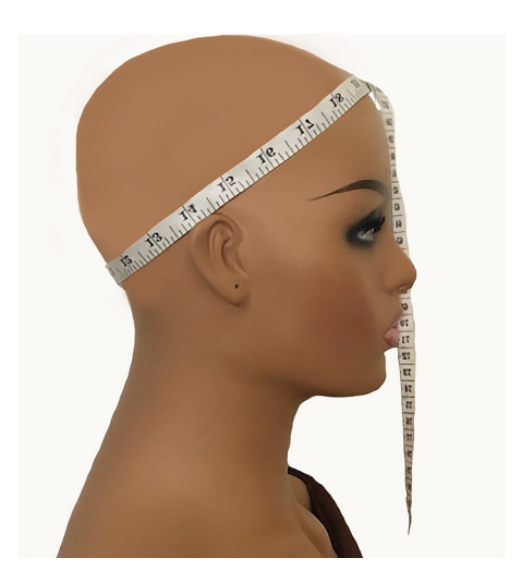
Start in front at your natural hairline and follow to nape of neck in back and all the way around to starting point.