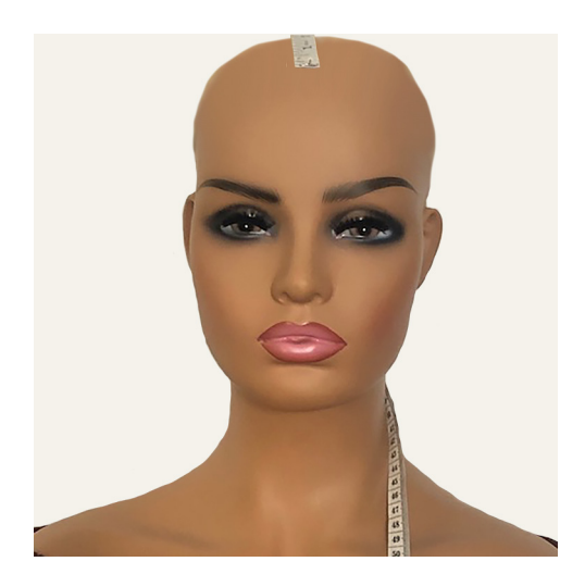
With hair lying flat, measure from natural hairline in front over your head and to the nape of your neck.