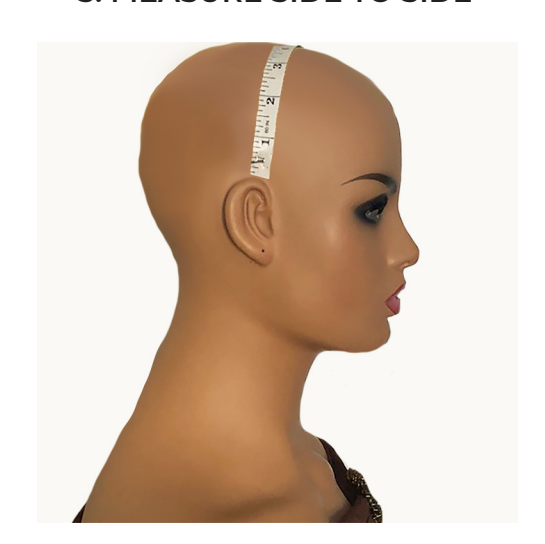
Start in front of ear where hairline ends. Bring tape measure over head to front of other ear.